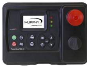
Tec-10 Murphy Auto Start