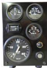
Optional Murphy Auto Start Panel