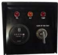
Optional Murphy Panel