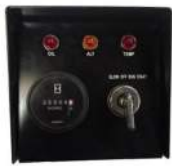
Isuzu Light Panel (A)