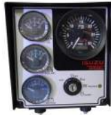
Isuzu Deluxe Control Panel (B)